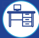
Desks & Chairs