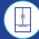
Breakroom Appliance Handles