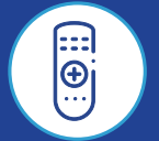
Remote Controls 2