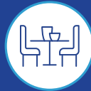
Counters & Tables 1